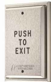
Single Gang ANPS5-111 $455.00