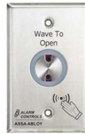
ANNTS-1 Single Gang $118.00