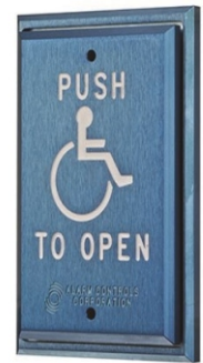
Single Gang ANPS1-443 $234.00