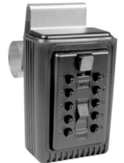
SUS7-001266 Black $82.10

Slips easily over window and is secured by rolling the window up. No tools needed. Equipped with stainless steel hanger and encased in rubber to protect window surfaces.